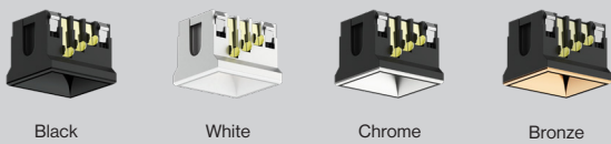
Black White Chrome Bronze